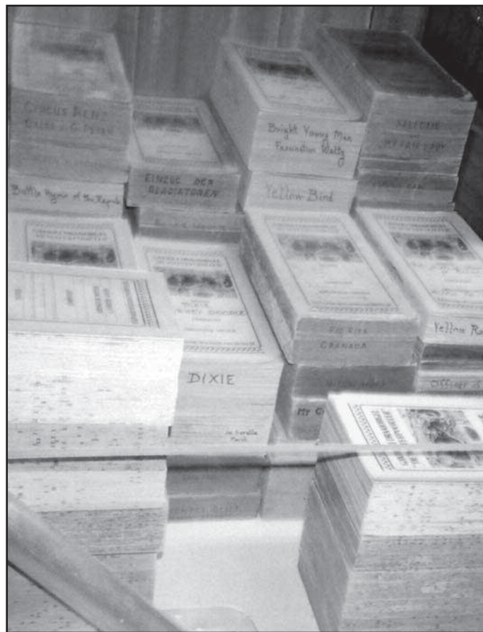
Figure 7. A partial view of the book library.

er melody notes ( Figure 6 ). The 84-key scale on this organ is not a standard fairground scale. Components include violins, saxophones, cellos, bourdons, trumpets, trombones, vox celeste, unda maris, bass drum, snare drum, wood block, cymbal, carillon and bells. There are 12 registers.