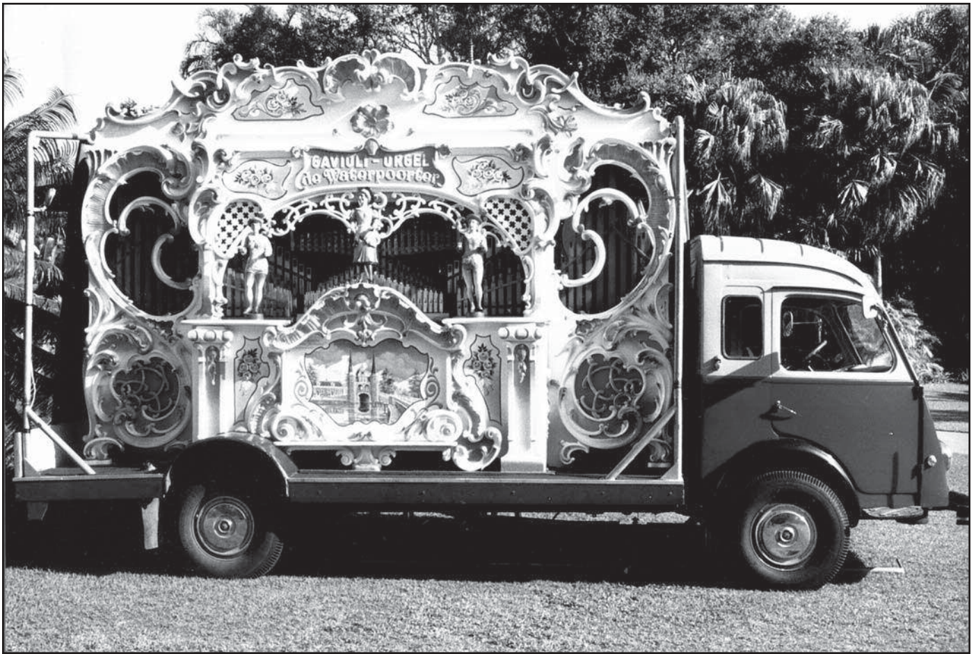
Figure 3. De Waterpoorter mounted on a 1953 Renault truck.

De Waterpoorter , translated to English, means, “The Water gate.” Before 1940, the small towns in Belgium charged a toll to pass through the canals. The toll was collected at a gate on the canal. A painting of the water gate at Sneek currently appears on the lower center portion of the De Waterpoorter façade (Figure 2).